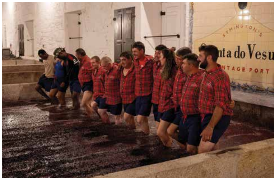
TRADITIONAL TREADING AT VESÚVIO

Touriga Franca is one of the most accurate barometers of vintage quality and performs at its best when conditions allow gradual, balanced ripening. In recent challenging years, the Franca has often fallen short due to erratic weather patterns – usually a combination of excessive heat and untimely rain. As the latest-ripening variety, it is the most vulnerable to unsettled weather which often emerges with the approach of the autumn equinox. In 2024, the Franca finally reached its full potential.