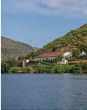
THE VESÚVIO WINERY, OVERLOOKING THE DOURO

In 2024, our head winemaker Charles Symington had an ample palette to choose from across the property's diverse micro-terroirs. He selected contributions from no less than five widely spaced vineyard sections, encompassing a multitude of aspects, altitudes and grape varieties from vines of varying ages. The magnificent Quinta do Vesúvio 2024 is composed of wines from the property's highest point, the Quinta Nova (Touriga Nacional); the 50-year-old Vale da Teja Touriga Franca plantings; the mature Alicante Bouschet from the Vinha dos Castelos; the lower-lying Touriga Franca of the Vinha da Estação; and another parcel of Touriga Nacional from the Vinha das Abelhas. It is this broad scope that provides an incredible choice to produce the best possible wine.