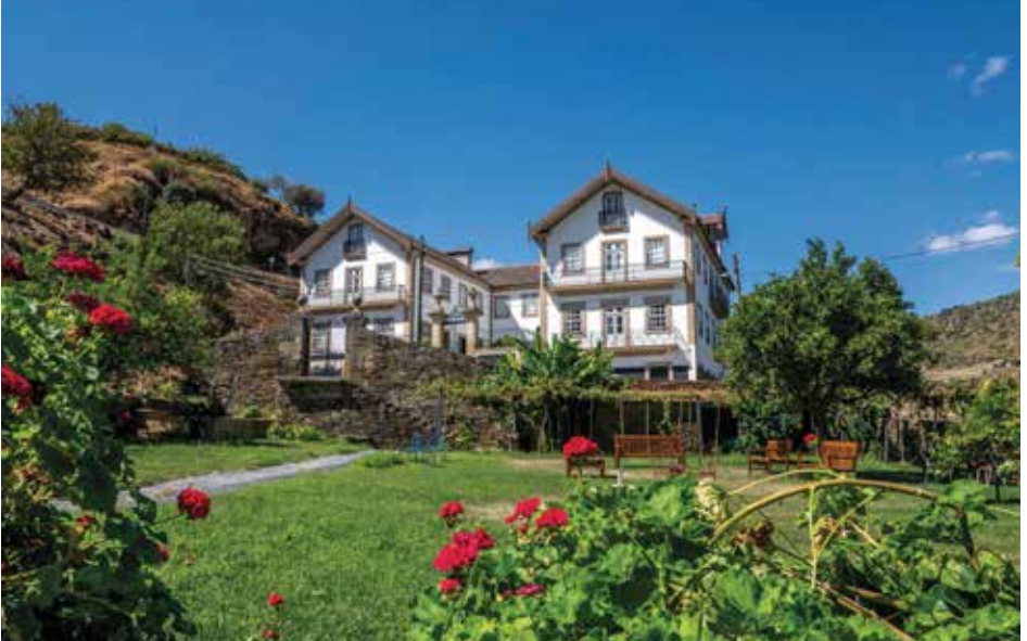
THE HOUSE AT VESUVIO WITH ITS INVITING GARDEN