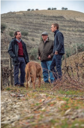
THREE GENERATIONS OF SYMINGTONS AT QUINTA DO BOMFIM