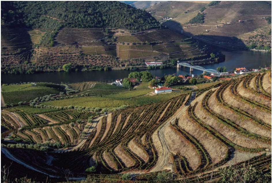
QUINTA DO BOMFIM

2024 saw the return of an old-style Douro vintage that previous generations of our family would have recognised. At Bomfim, picking began on 9th September, and the harvest only ended in the first week of October – the resumption of classic Douro timing after years of earlier, compressed harvests.