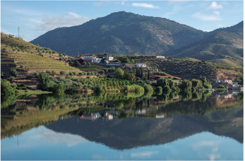
QUINTA DA SENHORA DA RIBEIRA