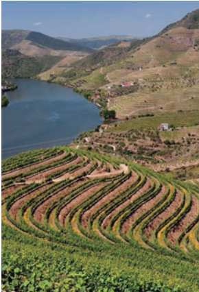
QUINTA DO SANTINHO

The Douro enjoyed a viticultural cycle with more moderate conditions, in line with the 30-year average for temperatures and rainfall. At Bomfim, cumulative rainfall for the year was 655.6mm, practically aligned with the 30-year average of 658mm. The bulk of this (just over 70%) fell during the winter months – critical for replenishing soil water reserves. In fact, it was the second wettest winter in the Douro of the last decade.