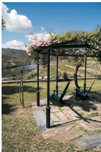
THE QUINTA'S CHARMING PERGOLA

VINIFICATION: the Senhora da Ribeira 2009 was vinified entirely at the quinta's dedicated winery in the lagares. The Touriga Franca and Touriga Nacional showed excellent Baumé readings, 14.1 and 13.8, respectively.