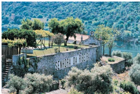
THE TERRACE AND CHAPEL AT SENHORA DA RIBEIRA

The Douro is one of the most diverse wine regions on earth and this is one of its underlying strengths. It is 100 km long and an average of 25 km wide, following the course of the Douro River and its many tributaries, thus forming a wide range of terroirs. Some vineyards skirt the river's edge at about 90 metres (295 feet), whilst others are high up the valley slopes, up to 500 metres (1640 feet). Accordingly, temperatures, rainfall, altitude and aspect (sun exposure), vary widely, which means that even in more testing years it is usually possible to make some very fine wines.